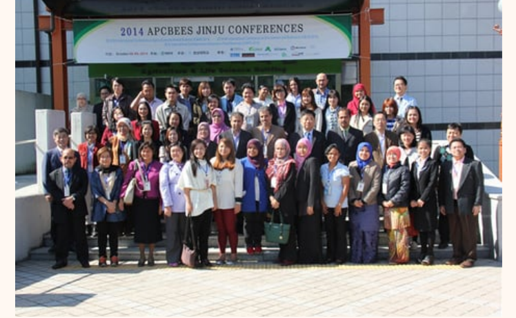
History Group Photos of ICAAS